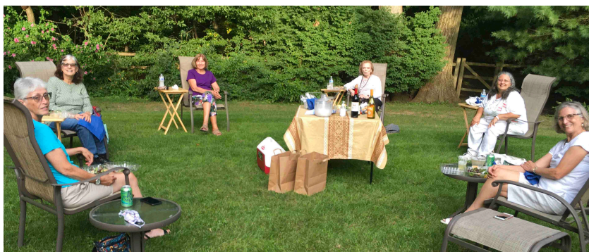
Evening Lit Group meeting on Sept. 9th!