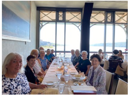
Westchester AAUW Summer Luncheon at X2O