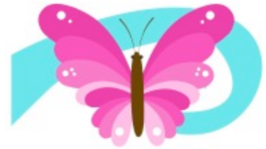
Women In Training, Inc.

The twins were stunned when their mother, who taught at an all-girls magnet school in Miami, told them that girls were using socks and toilet paper to absorb their menstrual blood. They learned that 25% of American mothers sometimes have to choose between buying food and providing their daughters with menstrual supplies. In order to help end period poverty, the twins went into action mode. They started Women in Training, Inc. on their 12th birthday in July 2019. WIT provides menstrual education programs and donates monthly WITKITS of menstrual, dental and hygiene supplies to young girls. Volunteers give the kits out to public schools, after school programs, homeless shelters, orphanages, foster care facilities and programs for imprisoned women and their children. So far they have distributed more than 15,000 kits. The twins soon realized that the core problem is the cycle of generational poverty. In their words; "In a world overflowing with resources, every human being can have plenty of nutritious and delicious food, housing, excellent health care, global education, ... and a bounty of menstrual products, and reproductive freedom!" To widen their mission to spread the message to end period poverty and poverty PERIOD they now collaborate with the Always brand of Procter and Gamble. They are also collaborating with Walmart.