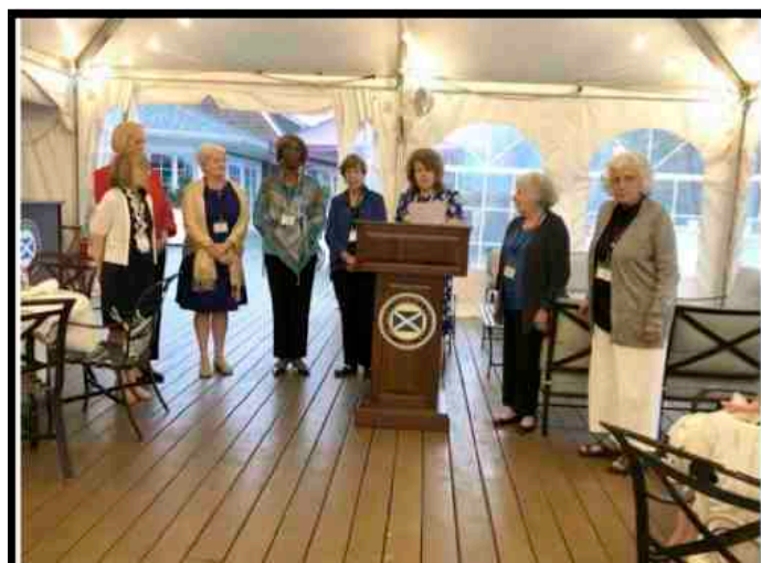
Induction of 2023-24 Board