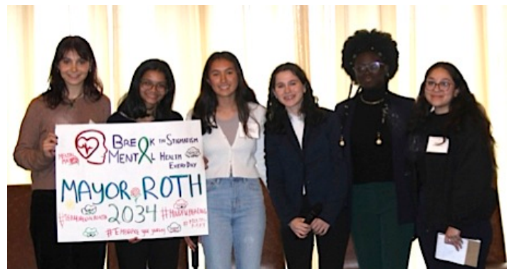
Campaign staff supporting Mental Health Center officials