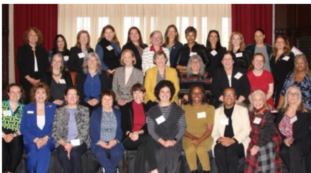
Group photo of elected officials who spent the morning with us.